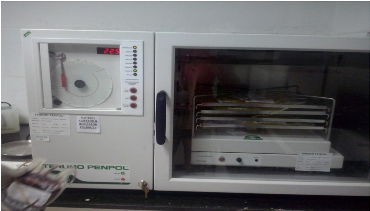
Platelet Agitator & Incubator