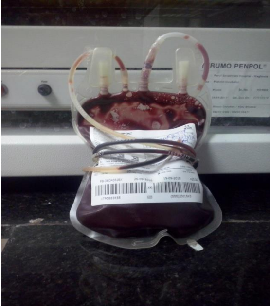
Packed cell Volume