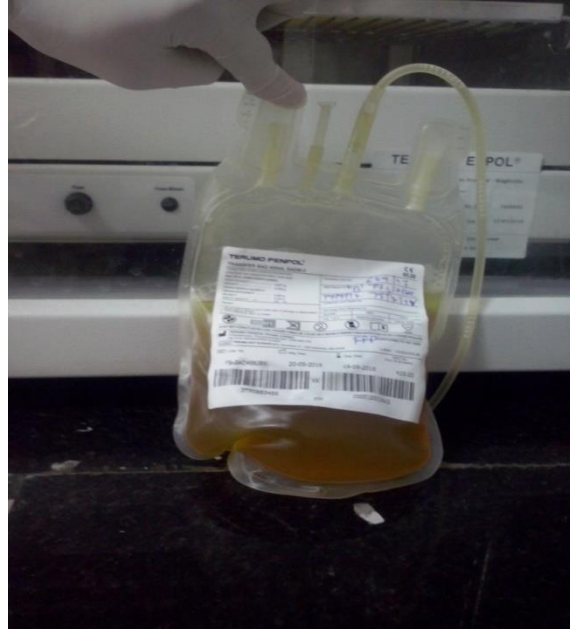
Fresh Frozen Plasma